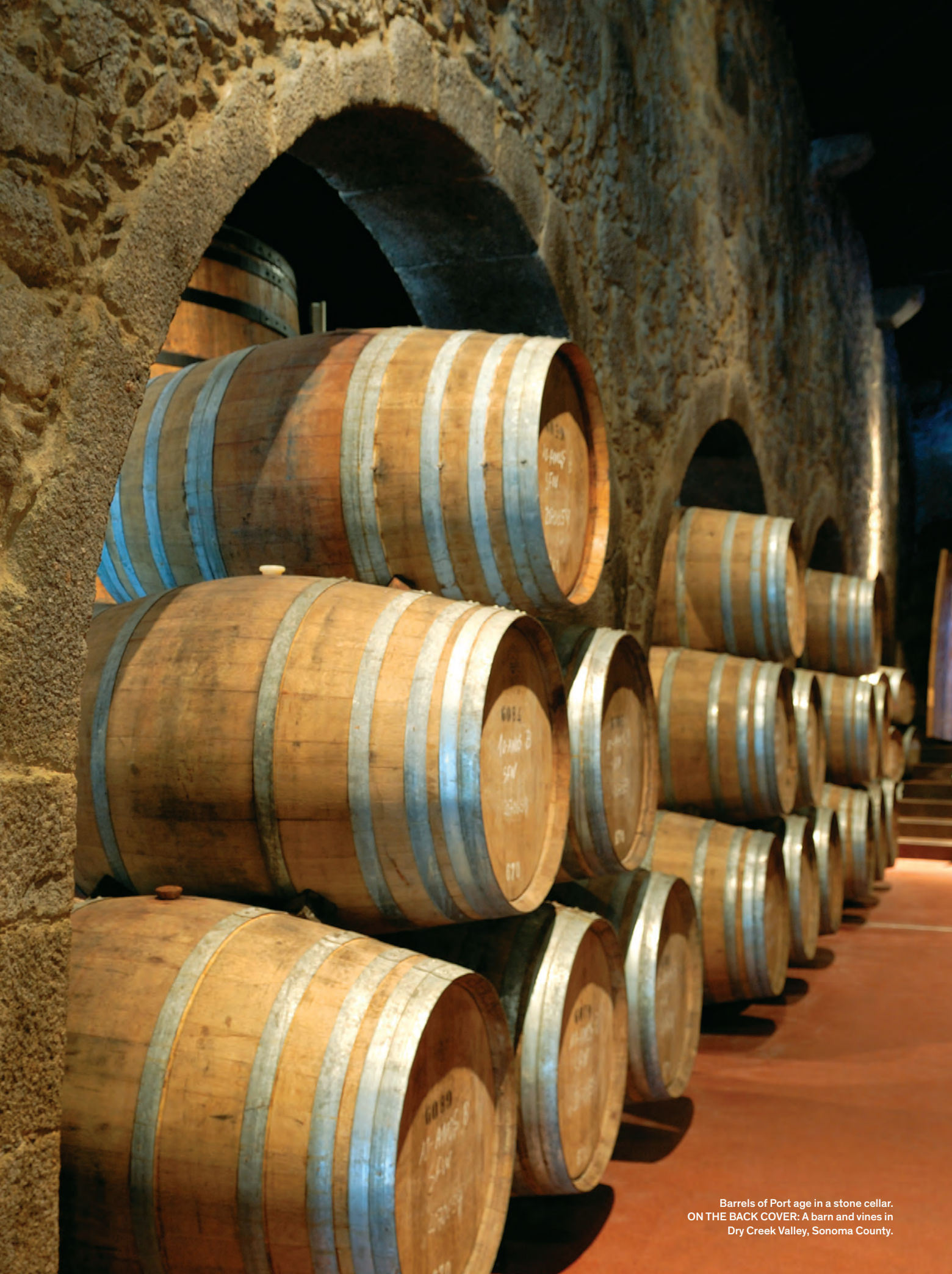
Barrels of Port age in a stone cellar. ON THE BACK COVER: A barn and vines in Dry Creek Valley, Sonoma County.